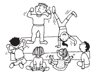
The celebration at the end of VBS was really cool!