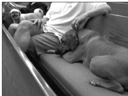
Blessing of the Animals - Oct 2