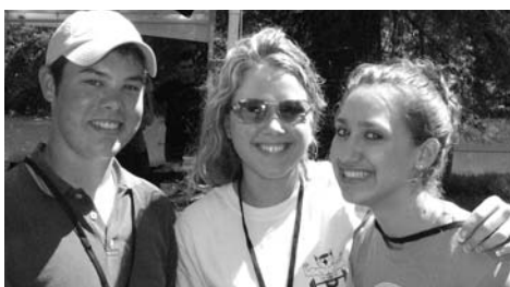
St. Martin's Youth attended Lutherstock at Camp Chrysalis in Kerrville. Lutherstock is an all-day faith and music festival, bringing together young Lutherans and their friends. You are never too old to go to camp! See page 9 for more information.