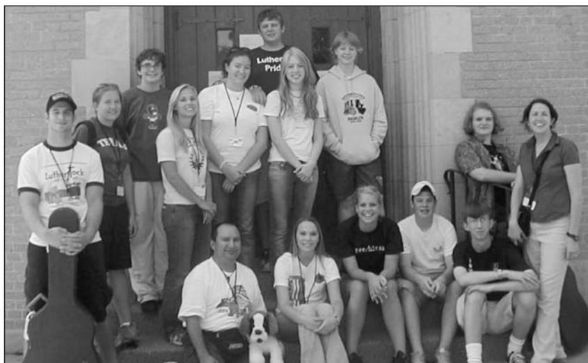
Sr. High Beyond Belief Mission Trip 2004 • Chicago • July 10-18

For more pictures, log onto www.saintmartins.org Senior High Youth: Watch for information coming soon about 2005 Wilderness Trip!