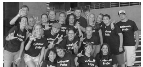
St. Martin's Youth outside the Georgia Dome – Atlanta Youth Gathering 2003

The theme for the Gathering is Cruzando: Journey with Jesus . The word Cruzando is a Spanish word meaning crossing. To learn more about the Gathering, log onto www.elca.org/gathering/home.html